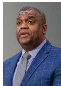
Justice Serge Georges Jr.

The SJC reversed the order, invoking the commonwealth's "strong and clear public policy in favor of protecting victims of sexual assault," which compelled an exception to the R.I. Grand Jury Subpoena rule.